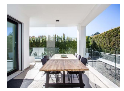
= 3 Bedrooms